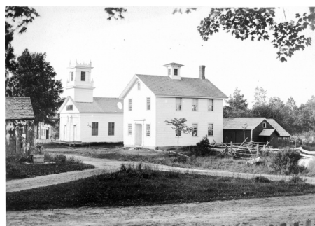
The library building (front) as the Bakerville School, and the old Bakerville Methodist Church (back), where the former firehouse is now.