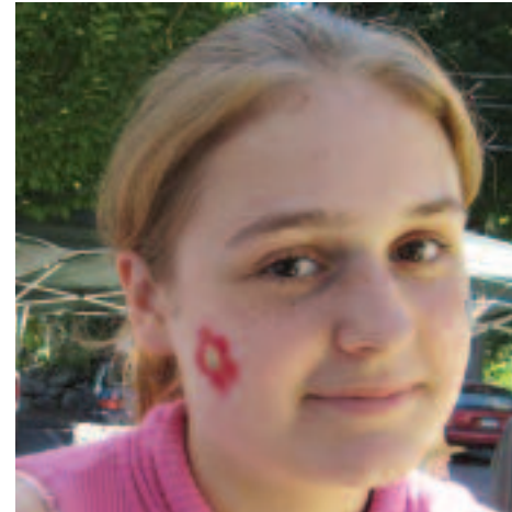
About forty people had their faces, arms, ankles, or hands painted at the Marketplace this year. 🏠

We had 87 participants fill out summer reading journals; they read a total of 2,018 books! The New Hartford Women's Club sponsored a delicious ice cream social at the library at the end of the summer. Check out the traditional poster with head shots of all our readers! 🏠